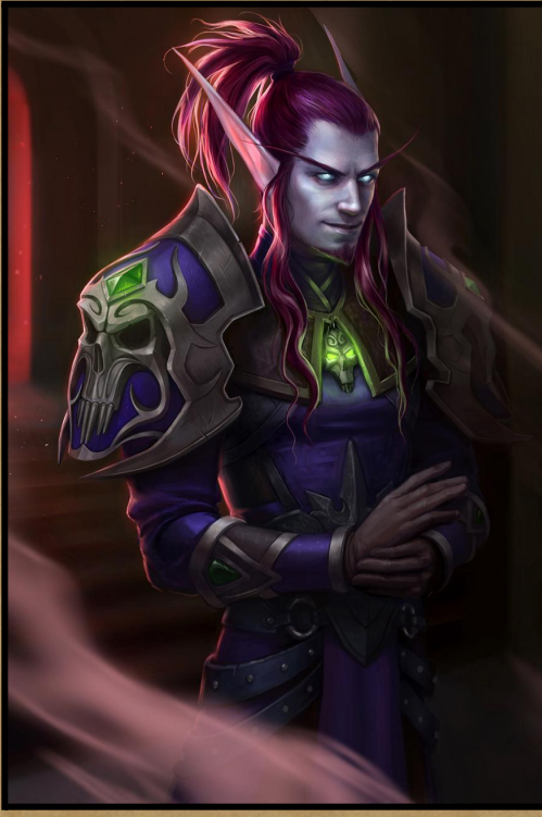
Vynlorin Shandaumath after his transformation.