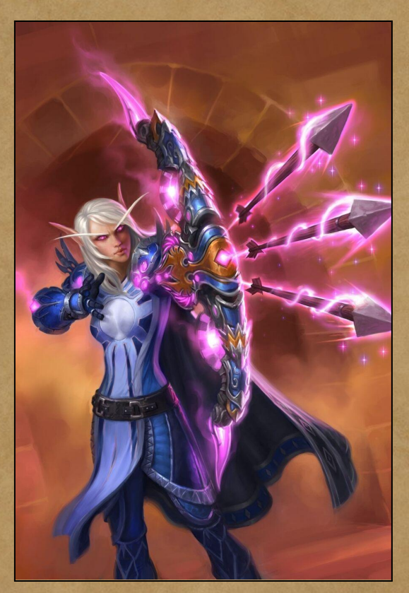
Vereesa Windrunner, Ranger General

Numerous civilian casualties are suffered, and the Sunreavers and